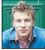
JAMIE OLIVER THE NAKED CHEF 2