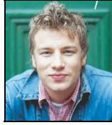
JAMIE OLIVER THE NAKED CHEF 2