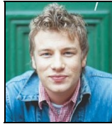
JAMIE OLIVER THE NAKED CHEF 2