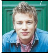
JAMIE OLIVER THE NAKED CHEF 2